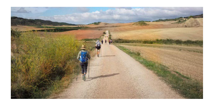
80 Pilgrims' II Course Fall 2024

Want to know more about the Christian Faith? Want to be baptized or confirmed? Want to become a member of Saint Thomas Church?